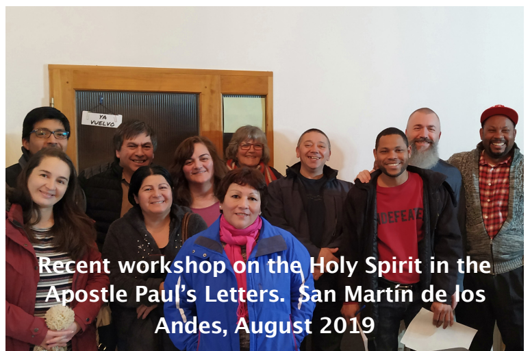
Recent workshop on the Holy Spirit in the Apostle Paul's Letters. San Martín de los Andes, August 2019